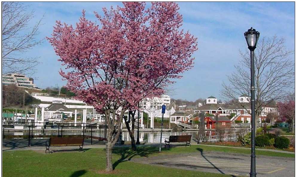
Norwich Harbor, historic downtown Norwich

Groups like the Small Business Development Center are great at making introductions. Try not to rely solely on cold-calls.