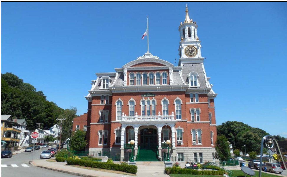
City Hall, 100 Broadway - Norwich, Connecticut

Mayor's Office 860.823.3742 dhinchey@cityofnorwich.org